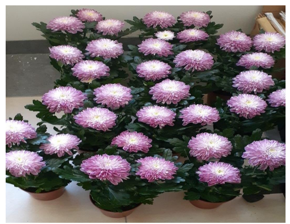
Fig. 1: Chrysanthemums bring from the nursery.

All save the top pairs of leaves were removed from the stems after they had been chopped with a sharp object to a length of 25 cm (Mashhadian et al, 2012). Each flower stock was then put into a 500 ml container with 250 ml of aqueous solutions (Fig. 2), with the flowers split into two groups and treated as follows: one group soaked in tap water, the other in magnetic water.