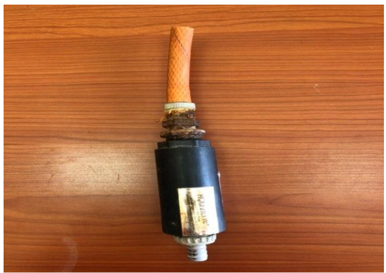
Fig. 3: Magnetic system

With the use of a magneto system with a force of 2000 Gauss, water exposed to a magnetic field was transformed into magnetized water (Fig. 3). The treated water maintains its properties for 12 to 24 hours.