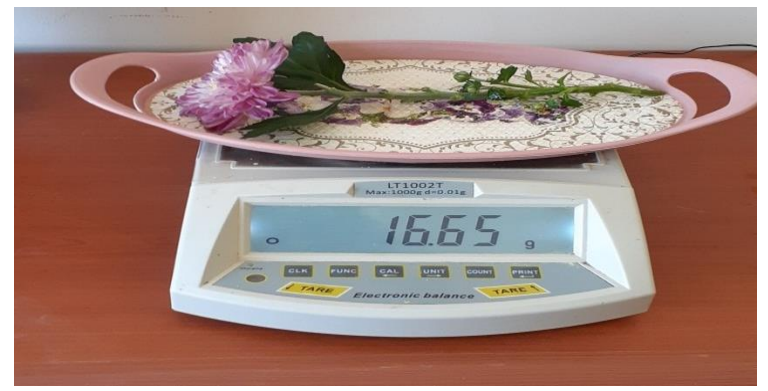
Fig. 5: calculate a fresh weight (g).

Calculate the water uptake (in milliliters) from each treatment (by subtracting the original volume of water in the bottle from that of water reduction in bottles containing flowers).