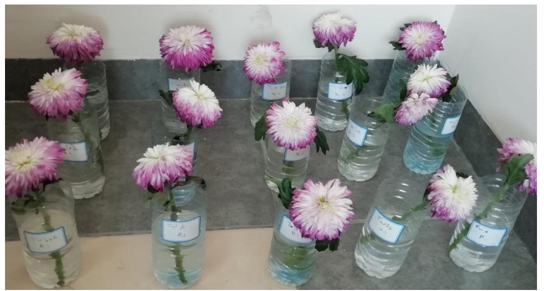
Fig. 2: Distributed flowers in bottles containing an aqueous solution.

Each treatment unit consisted of three replications, each of which was represented by a single flower. Okra extract was used to cover all of the flowers, which were then arranged in various positions throughout the room.