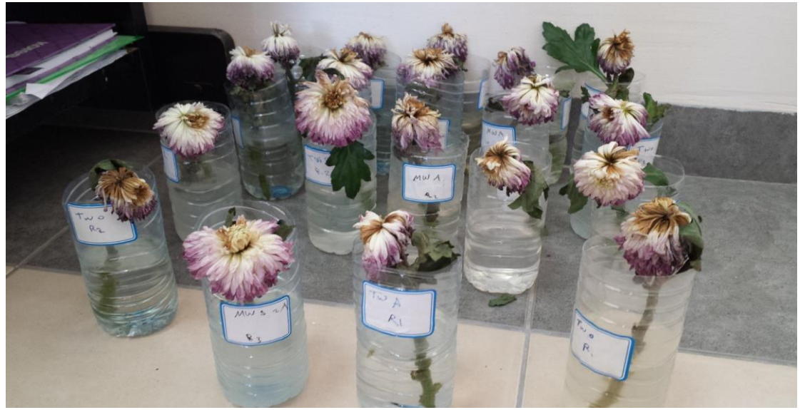
Fig. 4: Wilting of Chrysanthemum petals.

Vase life (days) : The number of days from the commencement of a flower's shelf life to the point at which its petals begin to droop or exhibit discolouration and senescence (Fig. 4).