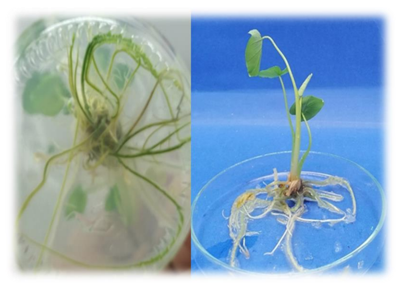
Fig. .3: Root induction of taro shoot at the rooting stage