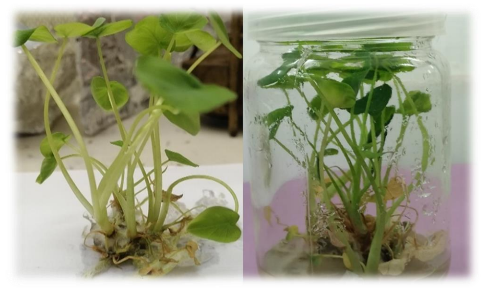
Fig. 2: Taro shoots multiplication at the multiplication stage.