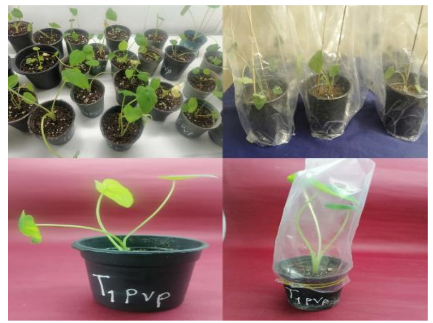
Fig.4: Acclimatization of newly formed plantlets ex vitro: in vivo of taro for 45 and 60 days.